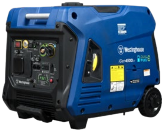
Recalled Westinghouse iGen4500DF Dual Fuel Portable Generator