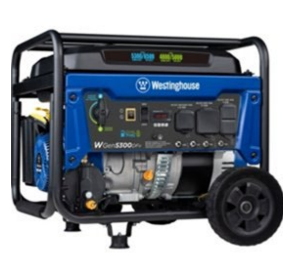
Recalled Westinghouse WGen5300DFv Dual Fuel Portable Generator